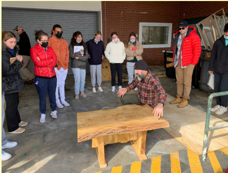
Urban wood workshop for JMU Architectural Design Class