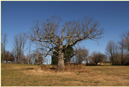
The iconic and historically significant Merry Tree before being decimated by a storm in 2020