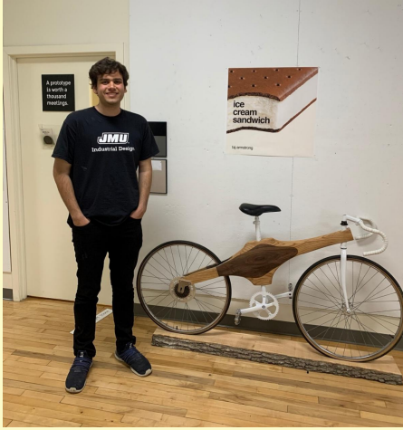
Creative wooden bike frames made from Harrisonburg urban wood