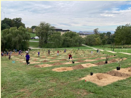
Below: Beginnings of JMU Food Forest