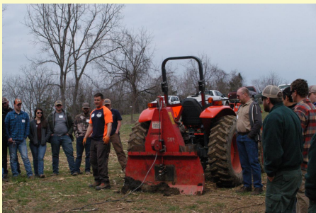
Small parcel harvesting equipment demonstration for MGCC classes