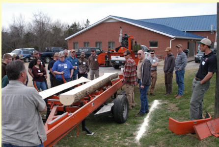
Urban wood workshops for MGCC students